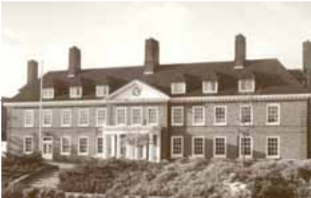
Peace Memorial Hospital

Step back in time and celebrate Watford Heritage week! The Peace Hospice building was originally the Peace Memorial hospital, built by public subscription to mark the First World War and opened by Princess Mary in 1925. It became a Peace Hospice in 1992 after a South West Herts Hospice appeal and enthusiastic backing from the Watford Observer. Have the chance to browse lovely stalls and tour this historic Hospice building.