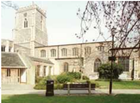
St Mary's Church

Watford's oldest building, this Grade I listed town centre church and tower will be open to the public to enjoy. The public are welcome to attend service at 10.30am on Sunday 14 September.