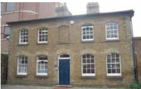
Henry Smith House

For more information tel: 01923 223554 www.guidepoststrust.org.uk